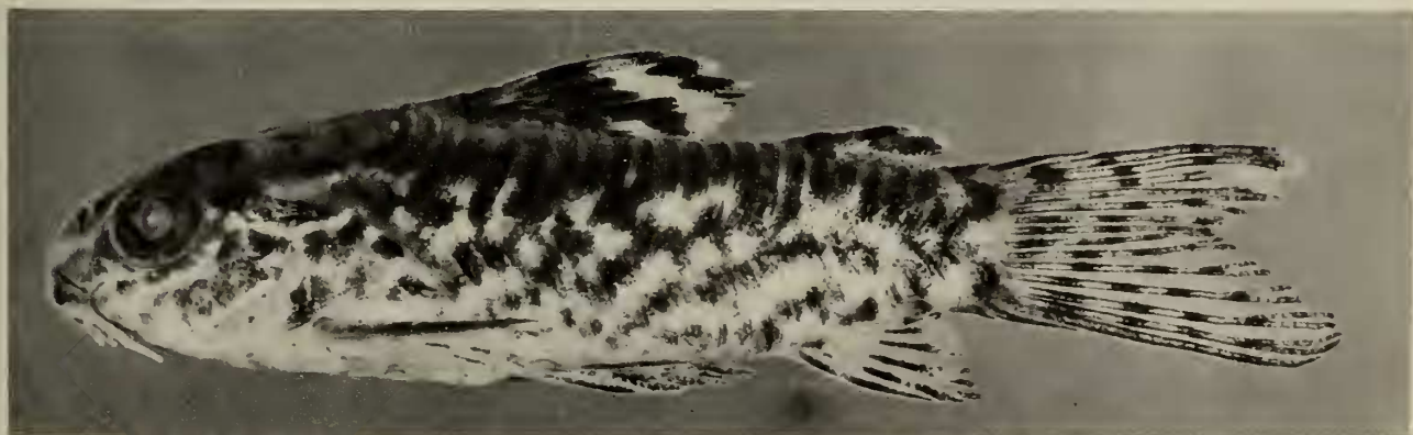
Fig. 2. Aspidoras pauciradiatus , ♂MZUSP, SL 16.5 mm, Brazil, State of Amazonas, Rio Negro, São João, near Tapurucuara.

Description. —Morphometric and meristic data are in Table 1. We present measurements of more parameters than Nijssen (1970) suggests, because we